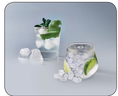
Dual Ice Maker with Ice Bites