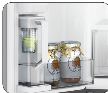
AutoFill Water Pitcher

Fingerprint Resistant Black Stainless Steel