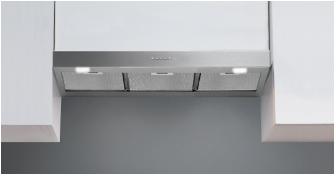
Photograph is for information purposes only May not correspond to the selected version