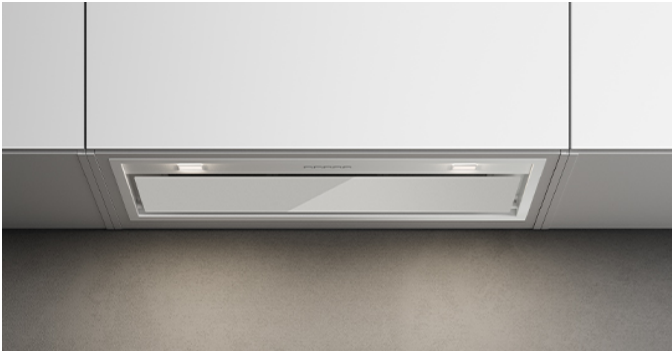
Photograph is for information purposes only May not correspond to the selected version