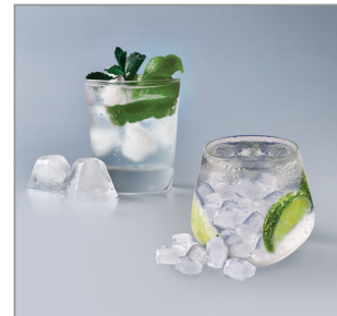
Dual Ice Maker with Ice Bites™